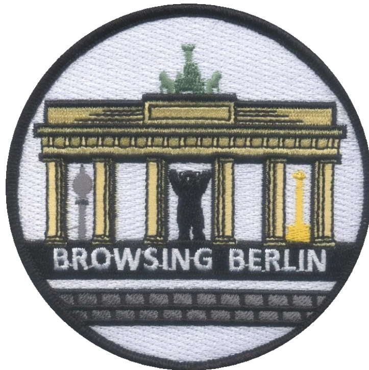
Brandenburger Tor (Gate)